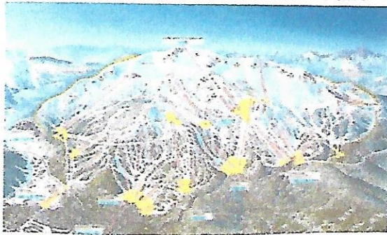
Mammoth Front Trails